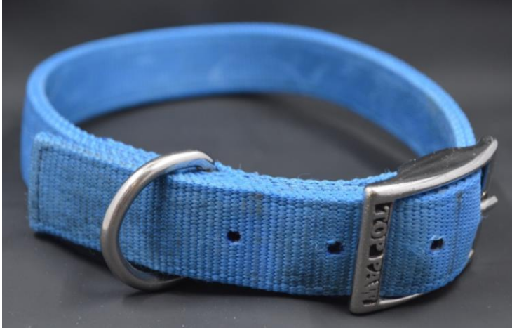
Figure 2.3 Snickers' Collar.