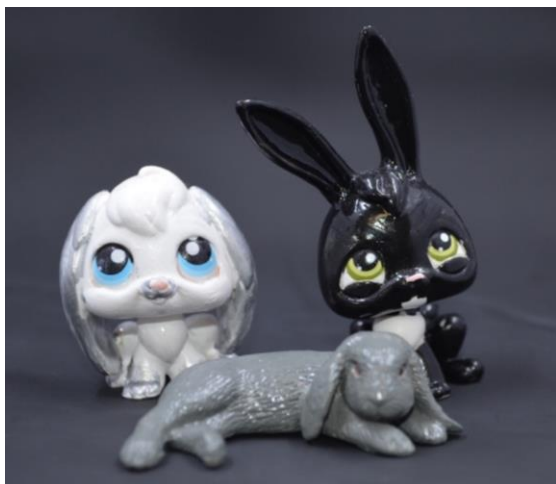
Figure 3.1 Customized Miniature Portrait Models of (Left to Right) Watson, Pipkin, and Sparkle.