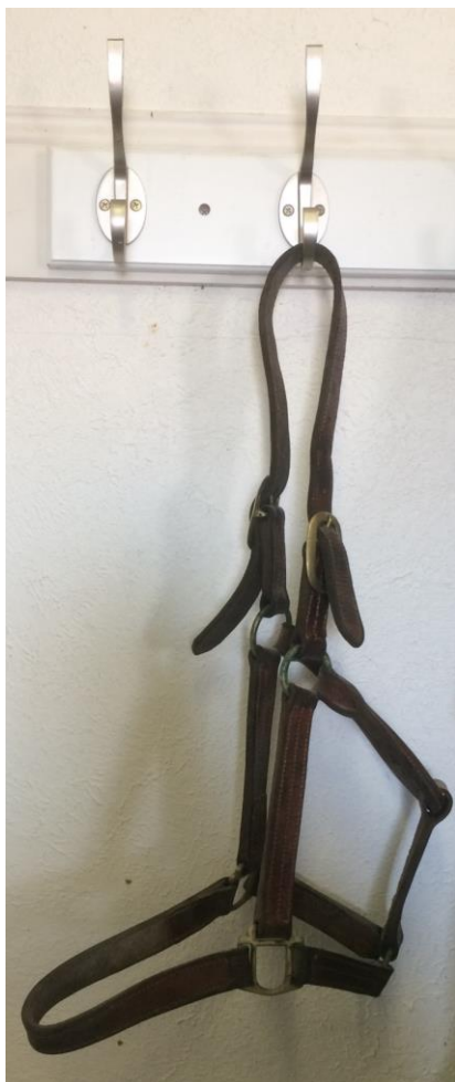
Figure 2.1 Aryk's Shipping Halter.