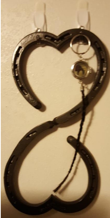
Figure 1.11 Kasey's Horseshoe Art Made From Bert's Shoes with Keychain.