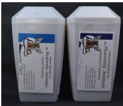
Figure 4.3 Twix's and Pipkin's Urns.