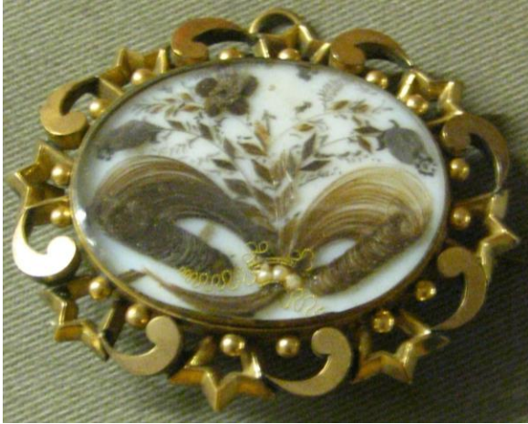
Figure 1.3 Example of Historical Mourning Brooch Containing Human Hair.