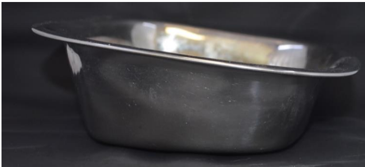
Figure 2.7 Sparkle's Salad Dish.