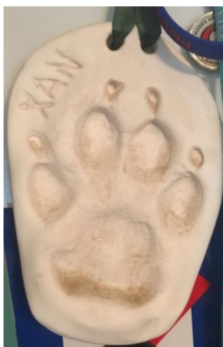
Figure 1.8 Ornament Made From Xanadu's Paw Impression.