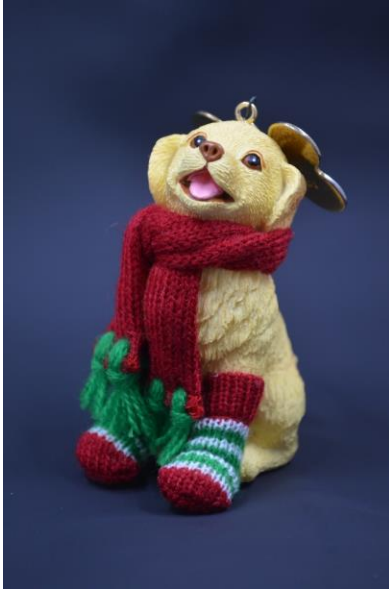
Figure 3.10 Jan's Snickers-esque Miniature Ornament With Tag.