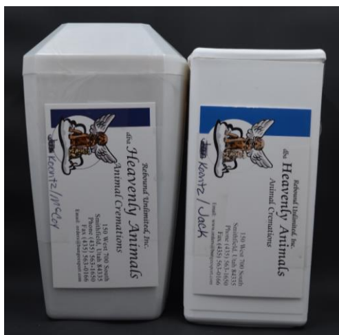
Figure 4.2 McCoy's and Black Jack's Urns.