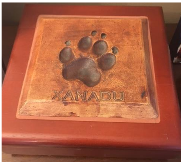
Figure 1.6 Xanadu's Box of Cremains With His Paw Impression.