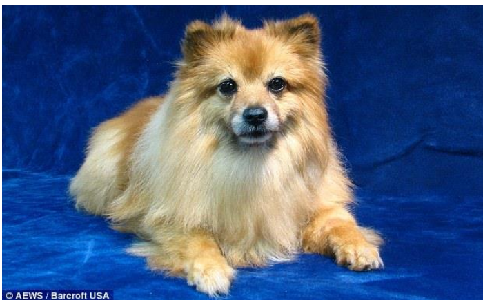
Figure 4.6 Dog Preserved by Freeze-Drying.