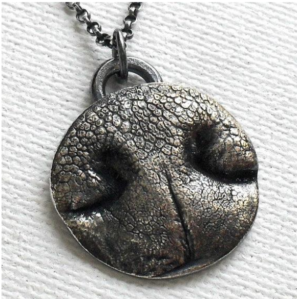
Figure 1.12 Cast Made From Nose Impression.