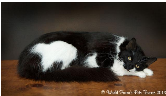
Figure 4.5 Cat Preserved by Freeze-Drying.