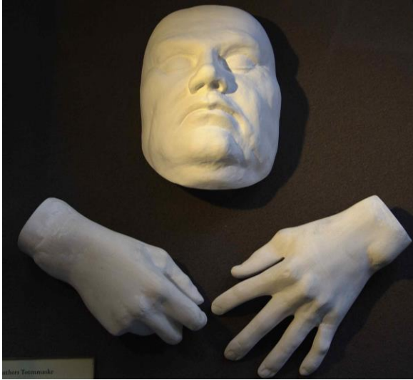
Figure 1.13 Example of Live Casting Death Mask and Hand Casts of Martin Luther.