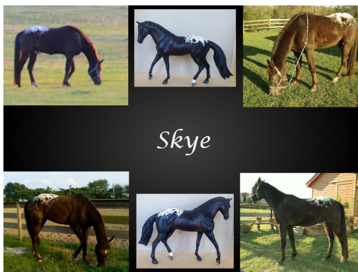
Figure 3.2 Customized Portrait Model Example.