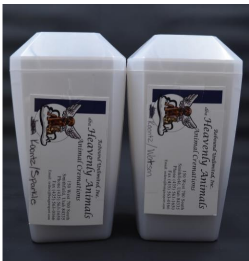
Figure 4.1 Sparkle's and Watson's Urns.