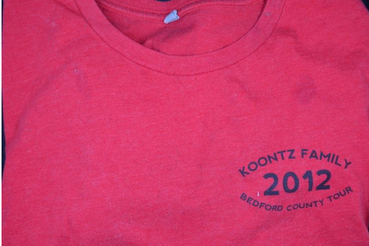
Figure 1.1 Shirt With Pipkin's Fur.