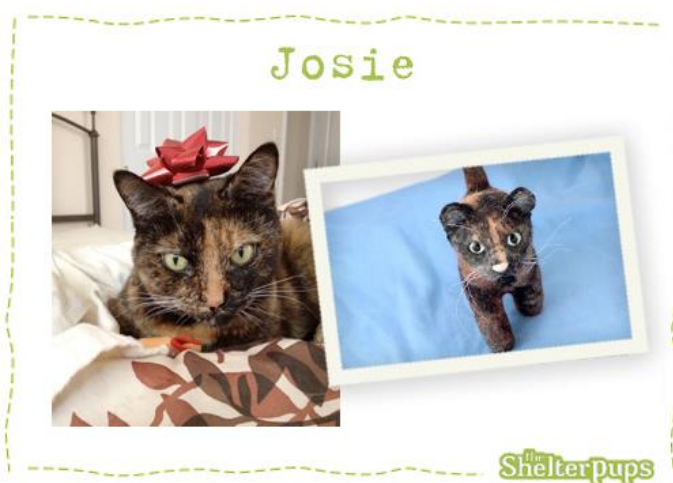
Figure 3.6 Shelter Pups Customized Felted Plush Example.