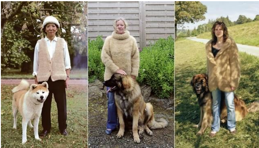
Figure 1.5 Examples of Clothing Made From Dog Hair.