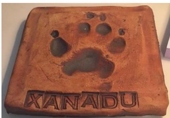
Figure 1.7 Coaster Made From Xanadu's Paw Impression.