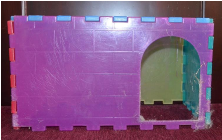
Figure 2.5 Sparkle's Block House.