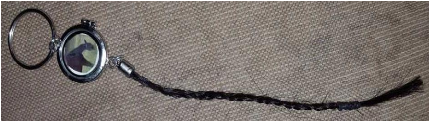
Figure 1.4 Kasey's Keychain Made From Bert's Tail Hair and Photograph.