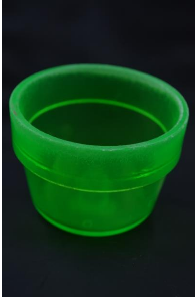
Figure 2.6 Sparkle's Food Dish.