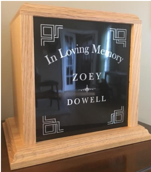
Figure 4.4 Zoey's Box of Cremains.