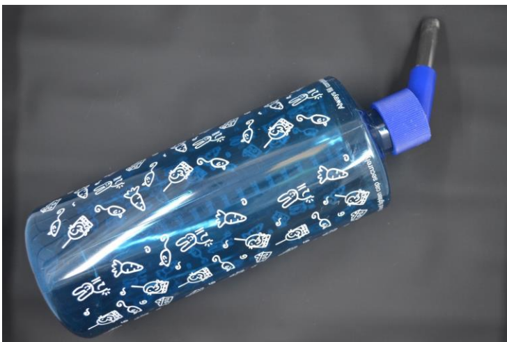
Figure 2.8 Sparkle's Water Bottle.