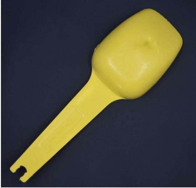
Figure 5.1 Jan's Tablespoon With Snickers' Tooth Mark.