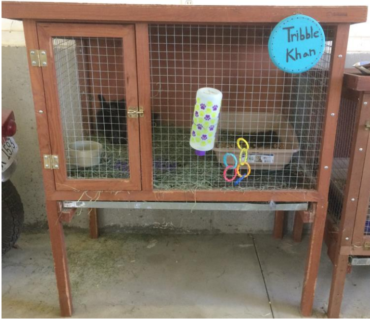
Figure 2.9 Sparkle's Cage Currently Occupied by Tribble.