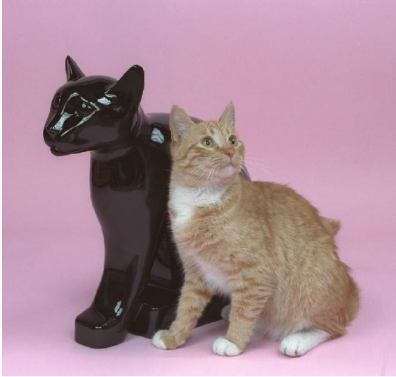
Figure 4.9 Buster and Cat Mummiform®.