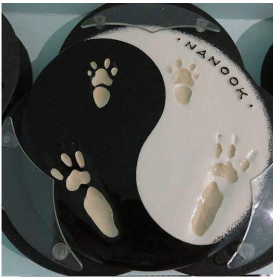
Figure 1.10 Impression of skinnypigs1's Guinea Pig Nanook's Feet Made by PearTree Impressions.