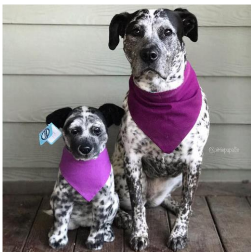
Figure 3.5 Petsies Customized Plush Example.