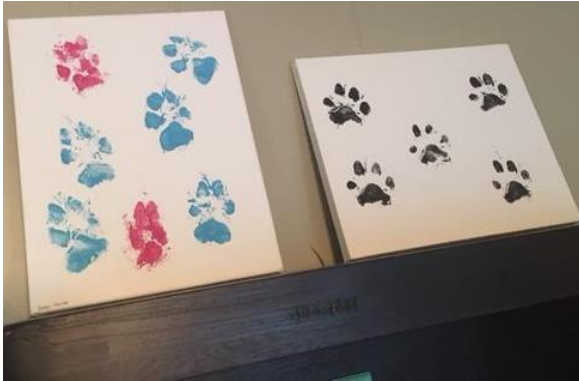
Figure 1.9 Canvases of Xanadu's and Zoey's Painted Paw Impressions.