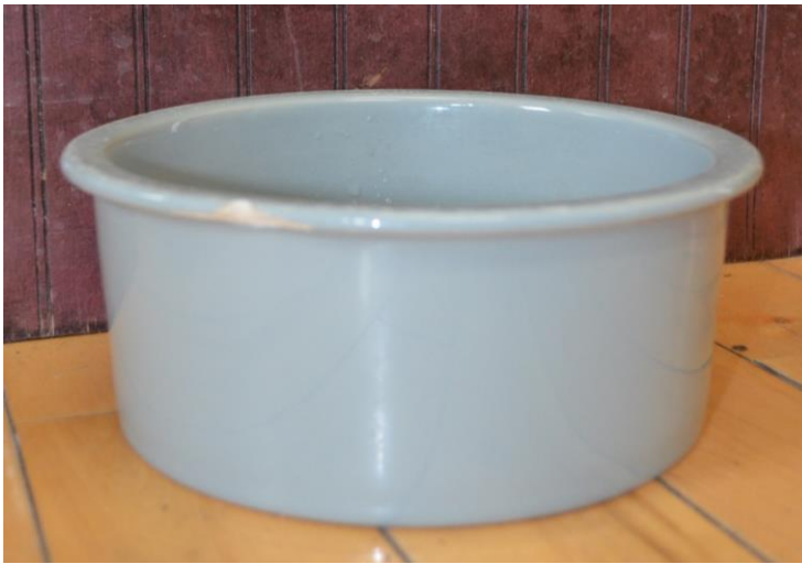
Figure 2.10 Snickers' Water Dish.