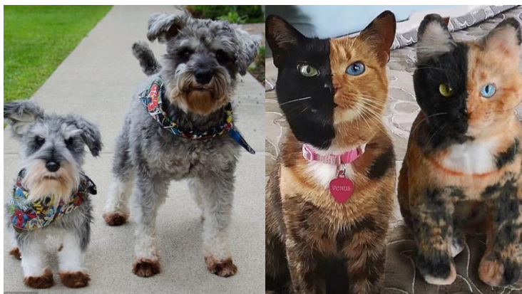
Figure 3.4 Cuddle Clones Customized Plush Examples.