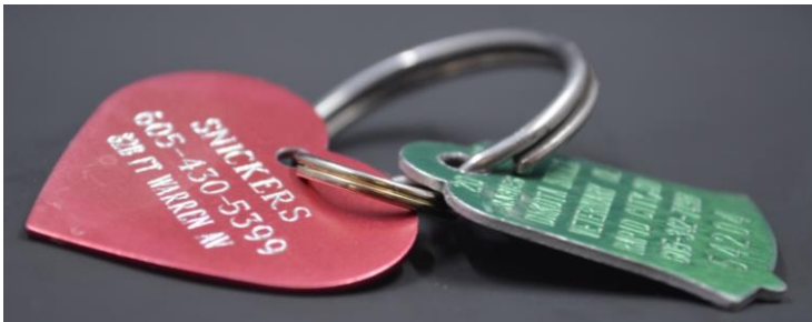
Figure 2.4 Snickers' Tags.