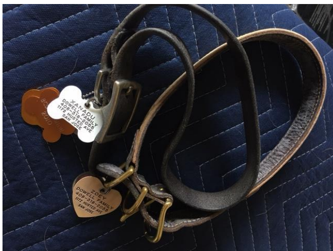
Figure 2.2 Xanadu's and Zoey's Collars With Tags.