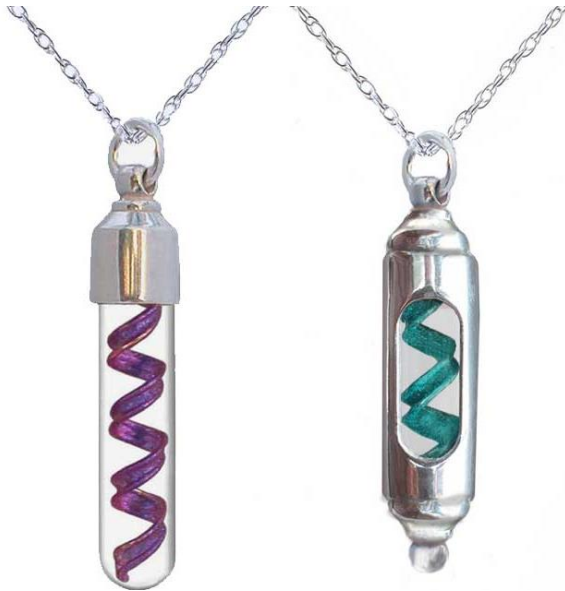
Figure 4.10 DNA Necklace.