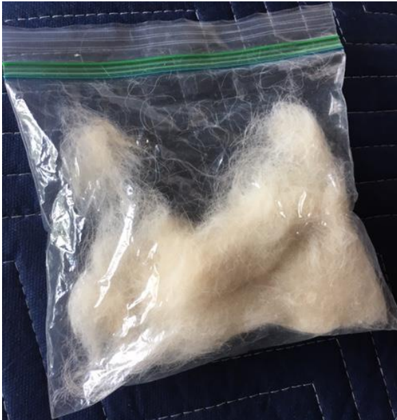
Figure 1.2 Bag of Xanadu's Fur.